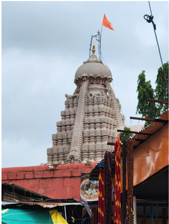
Grishneshwar Jyotirlinga Temple