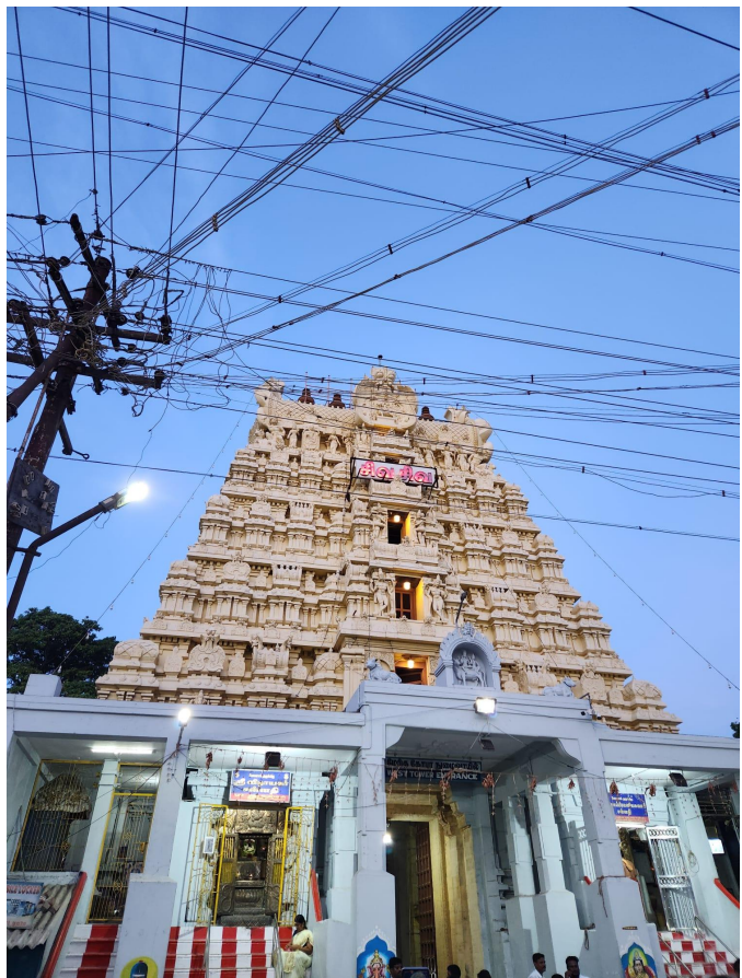
Rameshwaram temple, Tamil Nadu